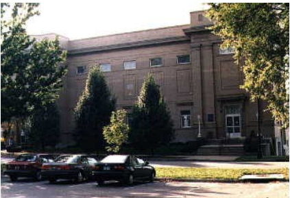
Summer time at Daniel H. Boughton Memorial Hall. Completed in 1922. Home of Hancock Lodge No. 311, Armed Forces Scottish Rite and National Sojourners. A true example of mid 1900's architecture.

Masons unite and help every way that you can. Your contributions and donations will be greatly appreciated.