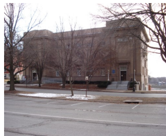
Front of DHBMH during the days of early fall/winter season.

is hereby, authorized to erect and maintain a suitable building, under such regulations as the Secretary of War may prescribe, in and upon the United States military reservation at Fort Leavenworth, Kansas, the plans of such building to be first approved and to be constructed in such location as may be prescribed by the Secretary of War : Provided , That the use of such portion of the ground floor of said building as may be necessary shall be given to the Post Office Department of the United States, free of charge, for the post-office service of the reservation .