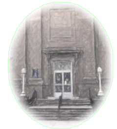
Boughton Memorial Hall

P.O. Box 3408 Fort Leavenworth, Kansas 66027 (913) 651-7308