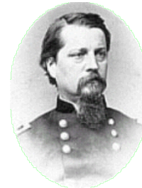
Maj. Gen. Winfield Scott Hancock