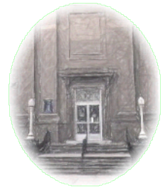
Boughton Memorial Hall

P.O. Box 3408 Fort Leavenworth, Kansas 66027 (913) 651-7308