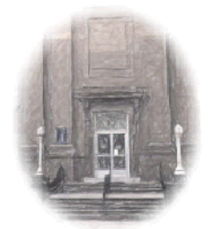
Boughton Memorial Hall

P.O. Box 3408 Fort Leavenworth, Kansas 66027 (913) 651-7308