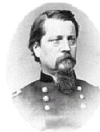
Maj. Gen. Winfield Scott Hancock