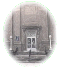
Boughton Memorial Hall

P.O. Box 3408 Fort Leavenworth, Kansas 66027 (913) 651-7308