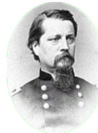
Maj. Gen. Winfield Scott Hancock