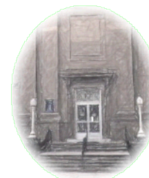
Boughton Memorial Hall

P.O. Box 3408 Fort Leavenworth, Kansas 66027 (913) 651-7308