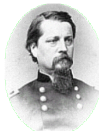
Maj. Gen. Winfield Scott Hancock