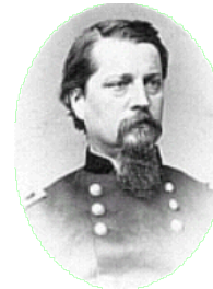
Maj. Gen. Winfield Scott Hancock