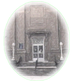
Boughton Memorial Hall

P.O. Box 3408 Fort Leavenworth, Kansas 66027 (913) 651-7308